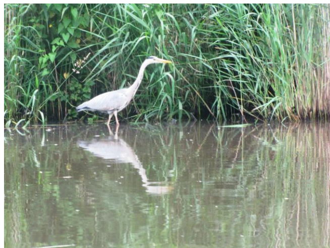
A heron pictured on the River Weaver