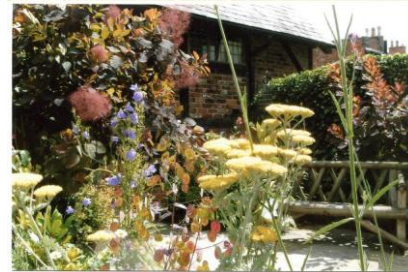
The garden at the Knutsford Heritage Centre.

At 3:15pm I left Knutsford vowing to return, I will try to make it on a Friday as there is a one hour walk round Knutsford, charge £5, and there is more to explore, such as the Knutsford Antique Centre and the Brook Street Heritage Site.