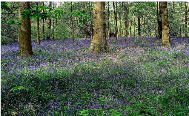
Bluebell Walk, Poynton

We start our walks at 10.30 (not 11.00am as indicated in the previous Newsletter). Twelve members joined the May walk which was circa 3 miles starting at South Park Drive, walking up Prince's Incline with stunning views then around the woods where we found carpets of bluebells which looked spectacular in the dappled light and many a photo was taken. The walk continued down the farmers field where the sheep and lambs frolicked. We ended the walk around Poynton Pool. All in all, a wonderful morning.