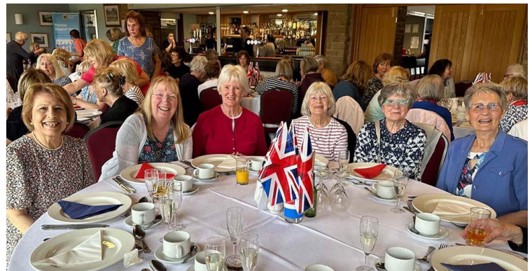
Coronation Tea. May