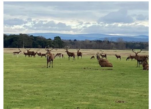
Red Deer herd