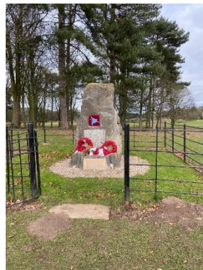
Monument to the Parachute Regiment