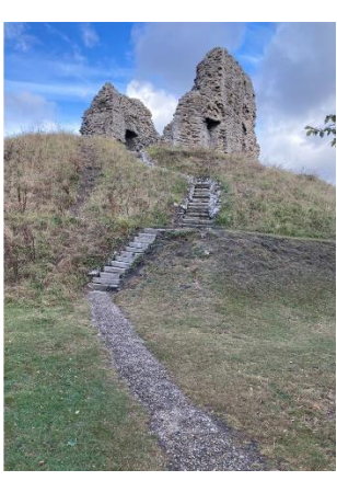
The Great Tower Christchurch