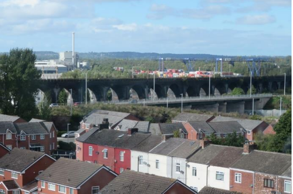
The long railway incline on the Widnes side of the bridge to reach the required height

During the early 1890s, the Manchester Ship Canal was constructed on the Runcorn side passing underneath the railway bridge. After the Manchester Ship Canal had been constructed the journey by ferry had to be made in two stages, linked (according to some accounts) by a climb over the wall of the canal.