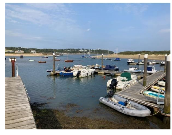
Bembridge Harbour, Isle of Wight

I then travelled to Portsmouth on a National Express bus and caught the catamaran to Ryde. I used my bus pass to get to my b&b in Sandown, and then again to get to Ventnor for my friend's celebratory afternoon tea. I had a lovely 12 mile coastal walk the next day from Sandown to Ryde, and bussed it back.