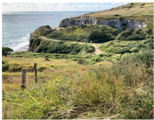
The Jurassic Coastal Walk near Swanage