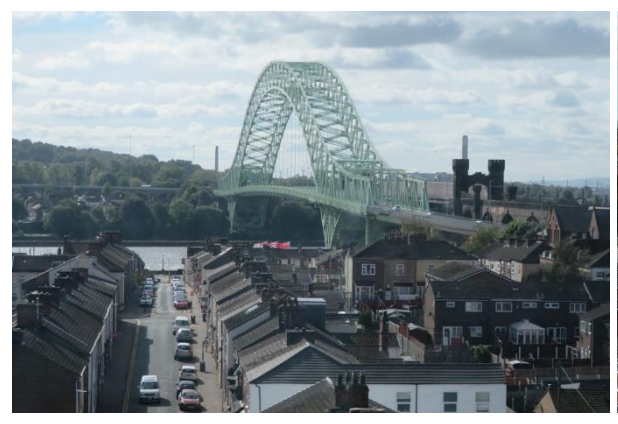
The turrets of the railway bridge behind the newer road bridge

The first bridge to cross the Mersey at this location was the Runcorn Railway Bridge, also known as the Ethelfleda Bridge or the Britannia Bridge. In 1861, Parliamentary approval for a railway crossing the Mersey was obtained by the London and North Western Railway (LNWR). The first goods traffic crossed the bridge on 1<sup>st</sup> February 1869 and the first passenger train on 1<sup>st</sup> April. The Admiralty insisted that the clearance under the bridge at high water had to be at least 75 feet which meant that there had to be long inclines on either side. The bridge carries a double-tracked railway and a pedestrian footbridge.