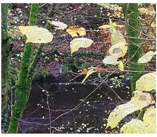
Spot the heron!

The lake provided a variety of bird life, mainly more common species in large numbers but especially noteworthy were six tufted ducks and a pochard with a stunning red eye which most obligingly swam right up to us. We were told by a local birder it had only arrived overnight.