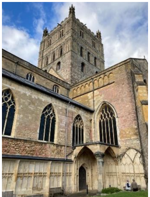
Old Sarum, Salisbury